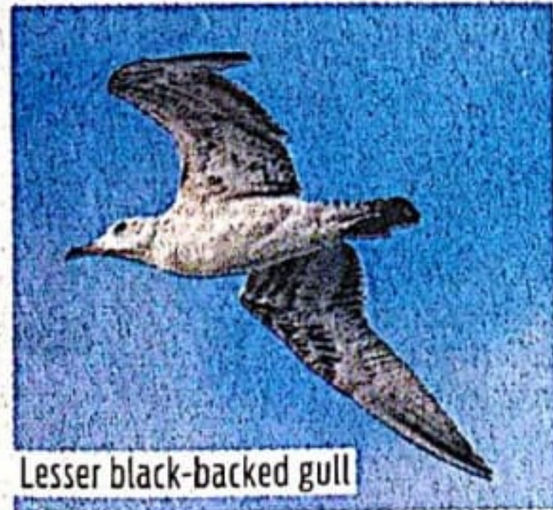
Lesser black-backed gull