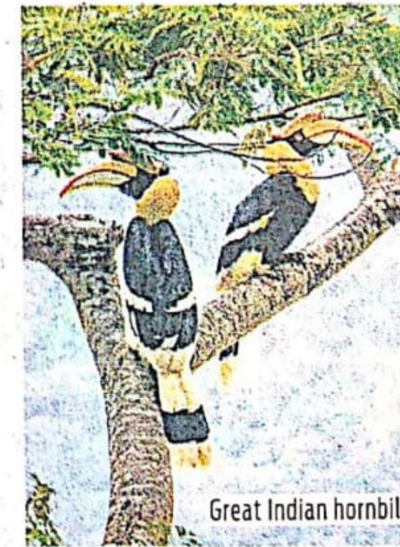
Great Indian hornbill

a platform for birders to come together and visit the many birding hotspots in and around the city.