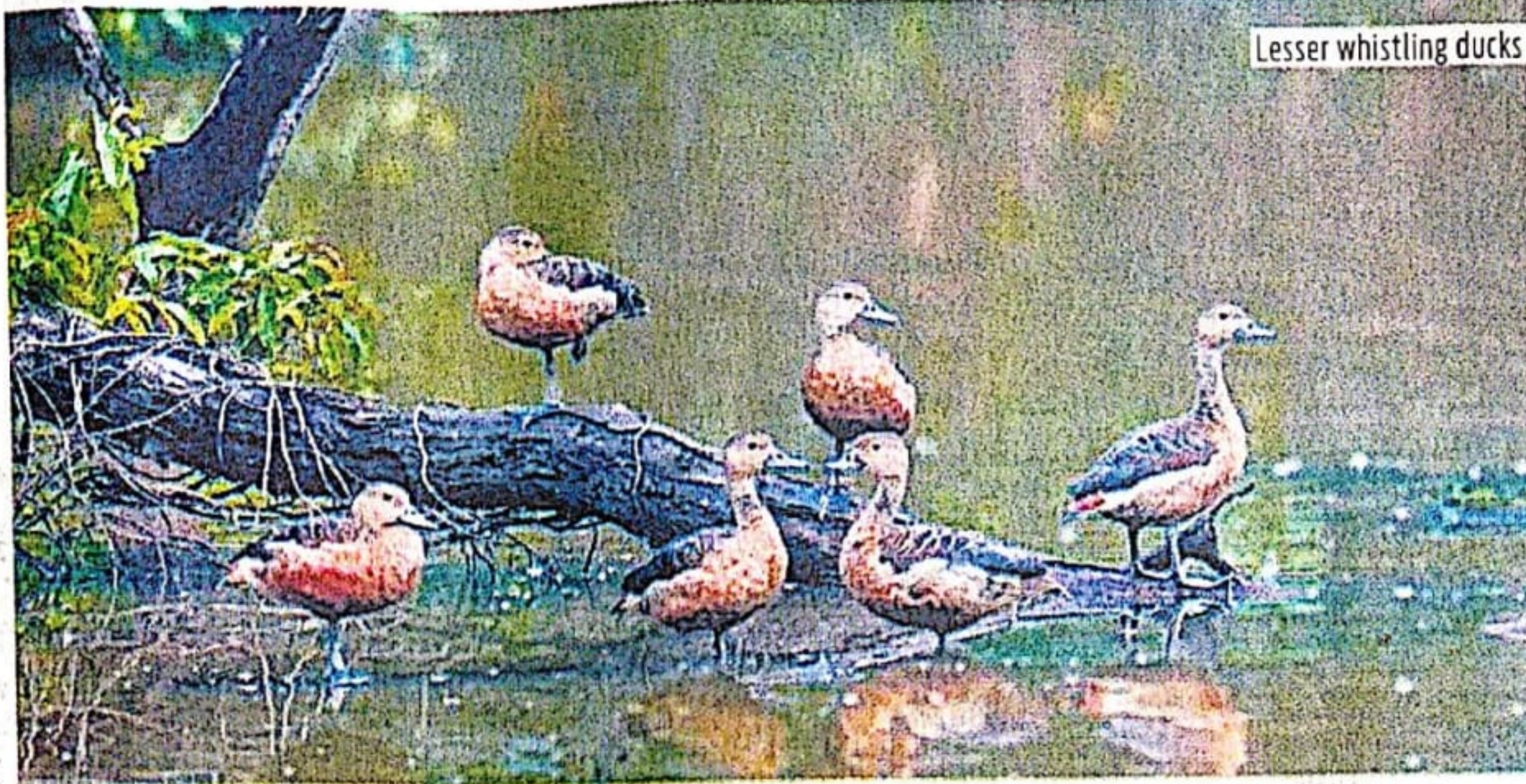
Lesser whistling ducks